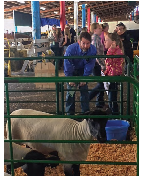
Many electric co-ops—including Lane Electric—support 4-H and FFA youth livestock auctions.

Clatskanie PUD, Clatskanie, Oregon. Employees and board members donated $3,800 to local food banks. The crew