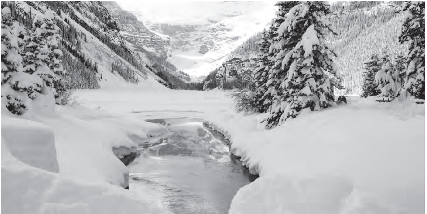
Rain is most often associated with hydropower, but snowpack keeps hydro facilities going strong during dryer months.