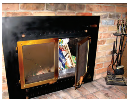
This fireplace draws in outdoor air to improve heated air circulation.