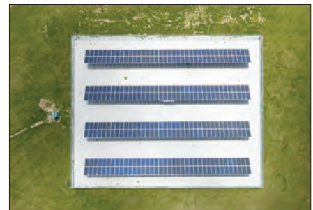
Community solar projects allow consumers to invest in solar power at a lower per-kilowatt-hour rate than smaller rooftop solar installations.