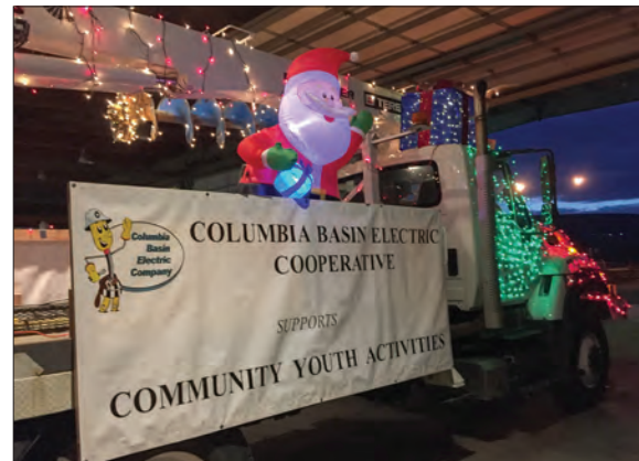
During the holidays, Columbia Basin Electric Cooperative, based in Heppner, Oregon, participates in community light parades. In exchange for their help decorating floats, the cooperative contributes money to local youth groups.

Tanner Electric Cooperative, North Bend, Washington. TEC offers five scholarships: three to graduating seniors, one to an accredited lineman college and one to NRECA's Youth Tour. Staff donates time and equipment to put up banners, replace lights, set up the town's Christmas tree, provide energy assistance through its round-up program, sponsor youth sports programs and present electrical