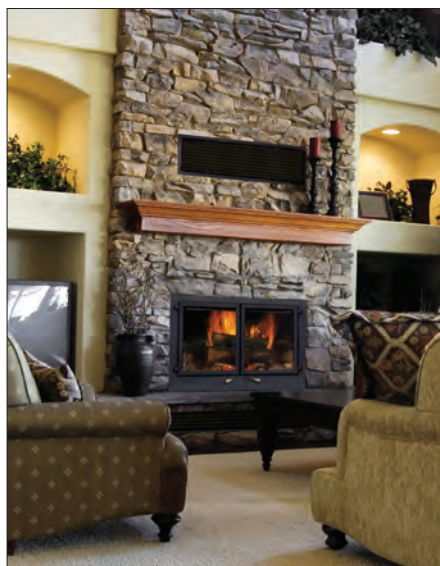
Decorative airtight doors on this heat-circulating fireplace improve efficiency and reduce air loss.