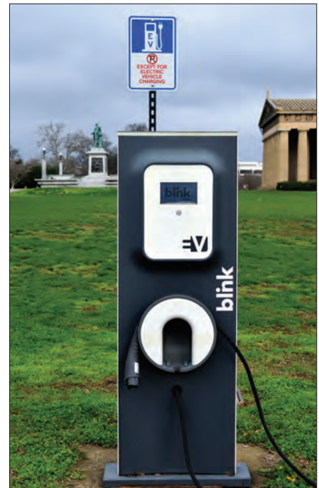
The network of electric vehicle charging stations is growing rapidly.