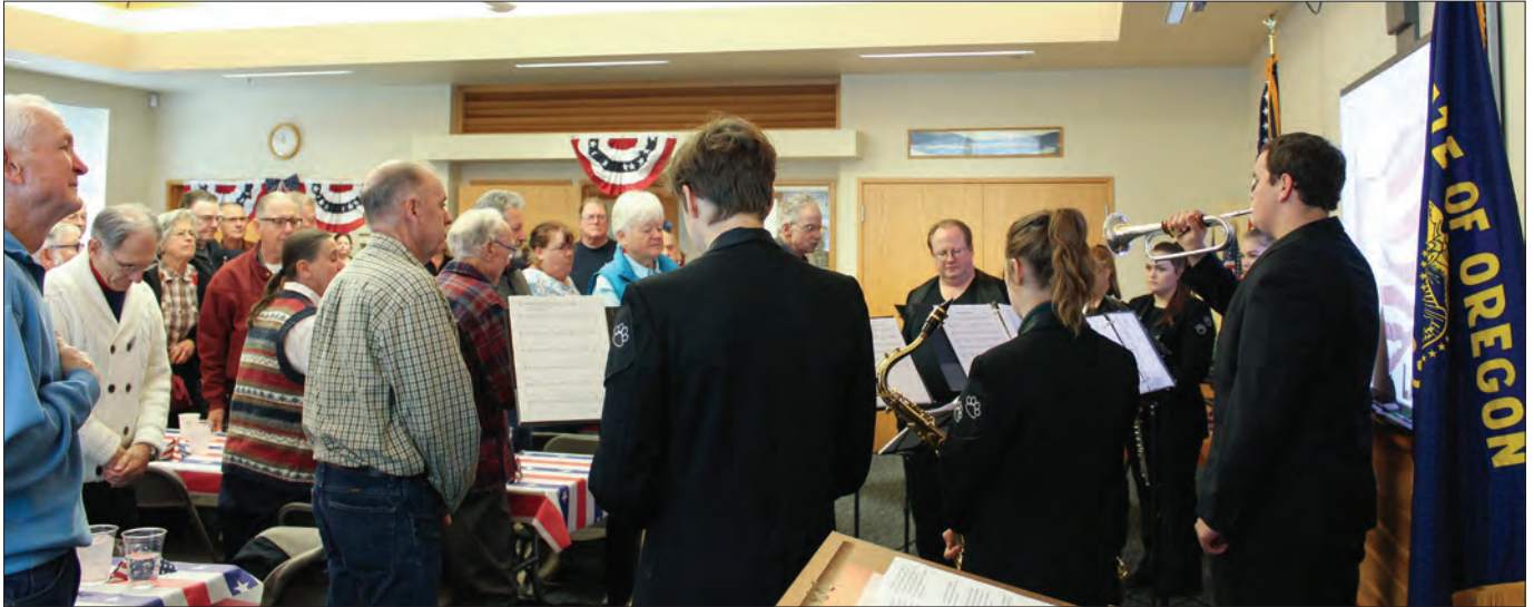
Above, the Crow High School Band performs for veterans at Lane Electric. Below, almost 60 veterans joined the LEC board and staff for lunch; a flag greeted guests.