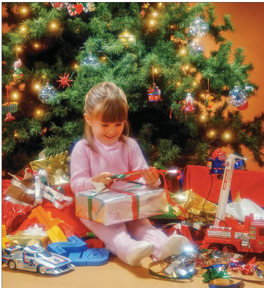
Keep Christmas merry by making sure your home is childproof before young visitors arrive.

Remember that a safe and happy holiday remains the best gift you can give friends and family. ■