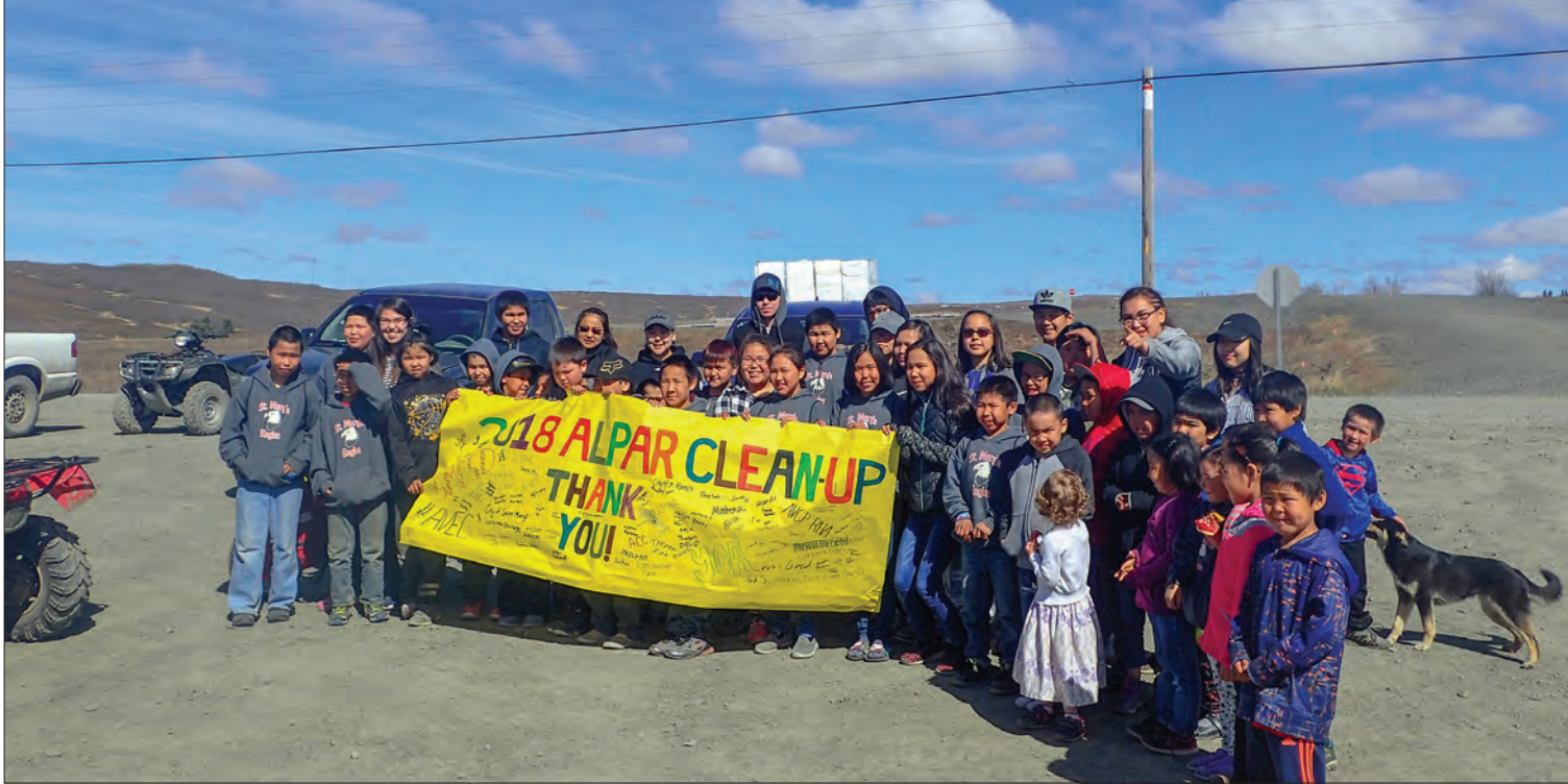
AVEC donates to many community-wide spring cleanups every year, including this one in Andreafski, Alaska.