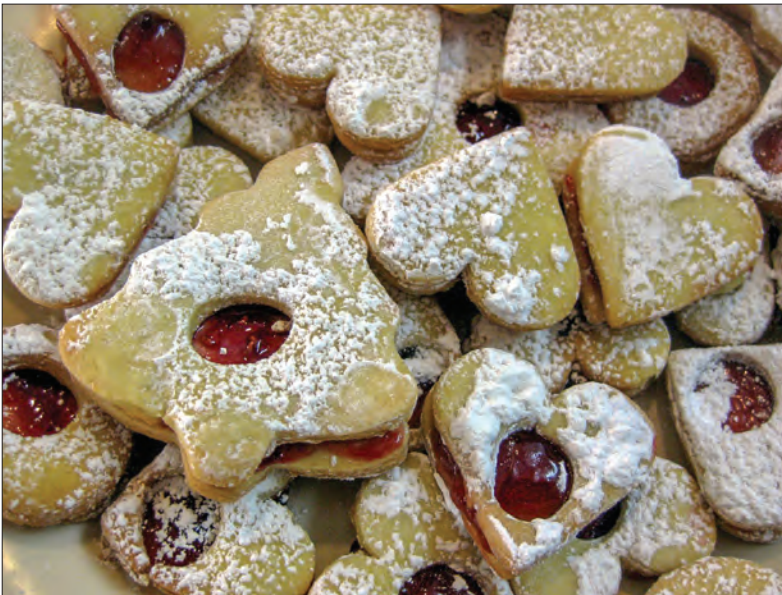
Baked goods are green gifts that will be consumed, leaving little trash behind.

As you celebrate the holiday season, consider how your presents could benefit the world by creating less trash and using less electricity