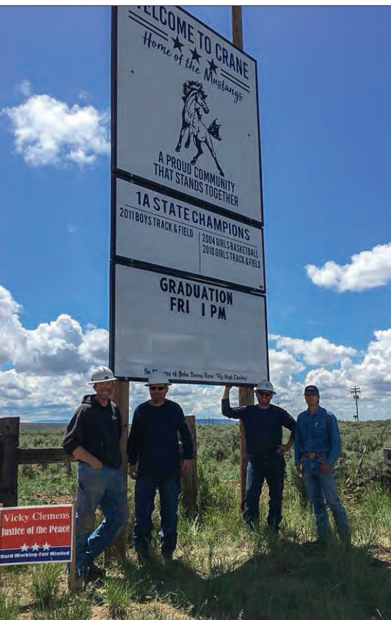
Linemen from Harney Electric based in Hines, Oregon, helped install a new sign for Crane schools.

Hood River Electric Cooperative, Odell, Oregon. HREC donated funds to help