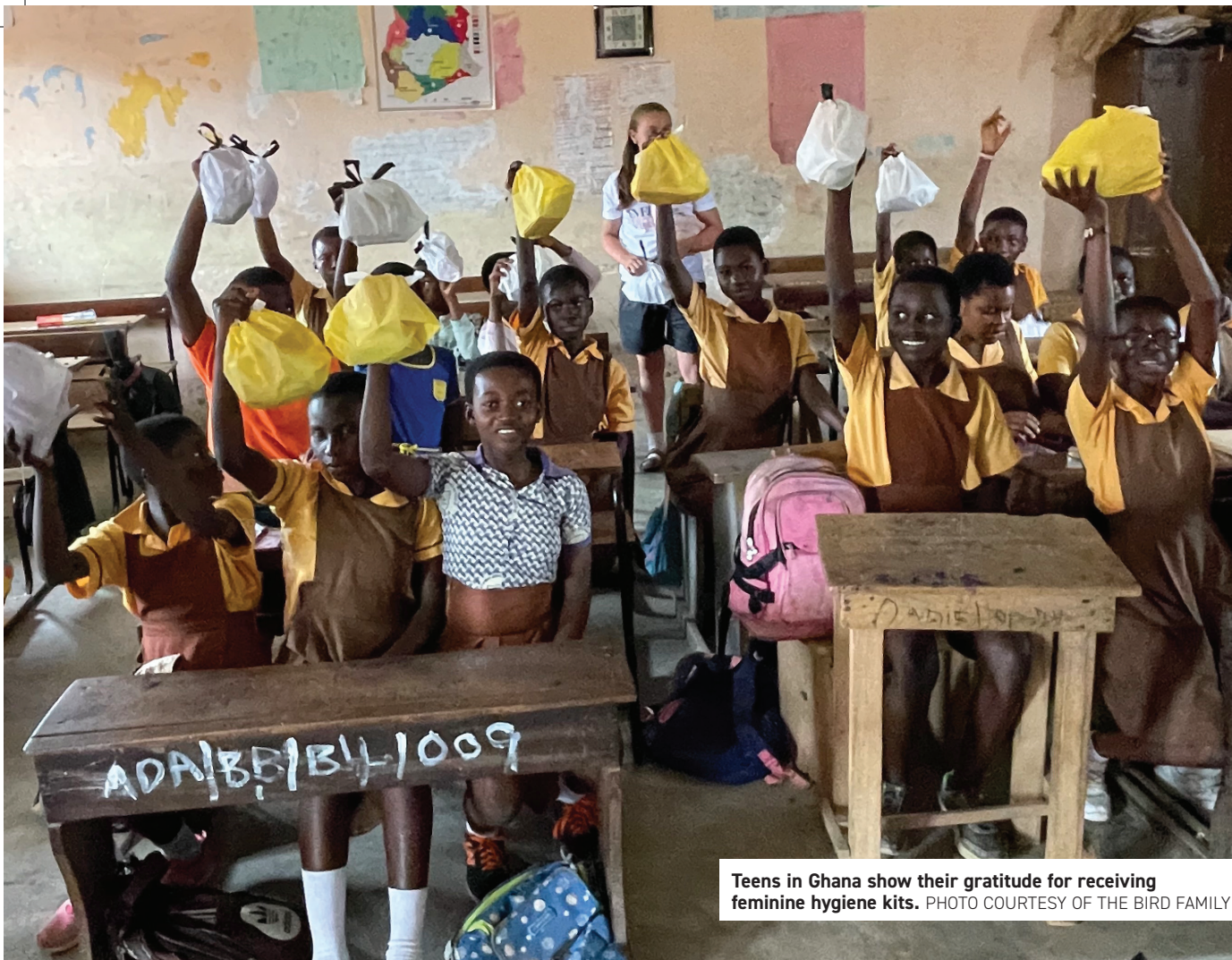
Teens in Ghana show their gratitude for receiving feminine hygiene kits.